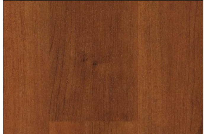
Warm Cherry TS 2022 (2.0mm) Weld Rod WR160 Mastic A1M160