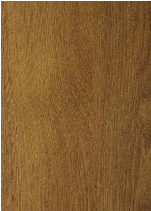
Traditional Oak TS 2018 (2.0mm) Weld Rod WR16 Mastic A1M258